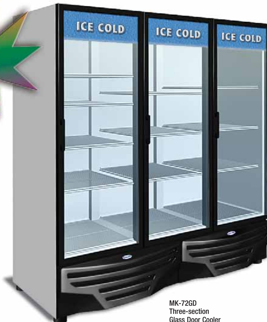
MK-72GD Three-section Glass Door Cooler