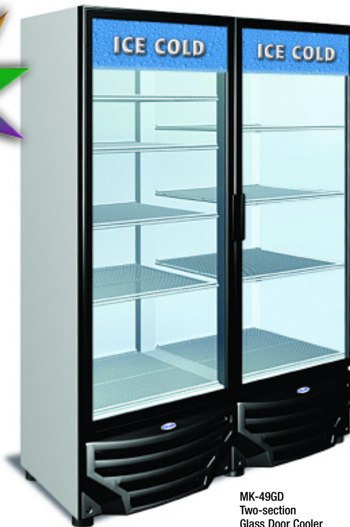
MK-49GD Two-section Glass Door Cooler